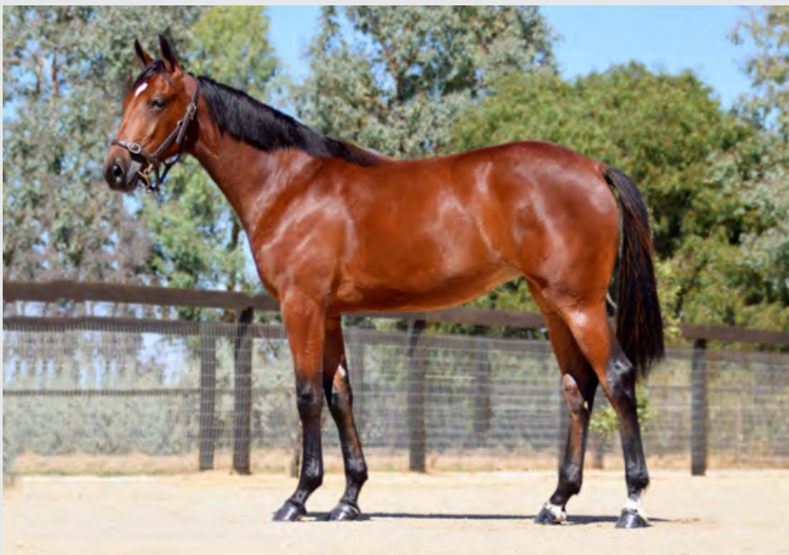
Lot 75 - FILLY from HOLDTHATDREAM by Fake Left.

Then an extra bonus in that this Colt is a half brother to the Group One winning filly from last season in Soho Historia 1.54.3 $192,637. It is the Family that produced the mighty Bag Limit 1.56.8 so it would be no surprise if this LOT 224 develops into a genuine Stakes calibre horse. Remember - Good things come to those that wait.